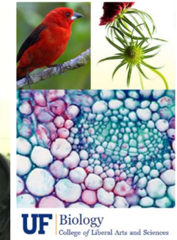
UF Biology College of Liberal Arts and Sciences Department of Biology